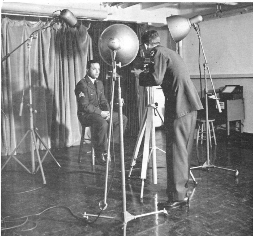
PFC William Trinkaus sets up a portrait shot of Sgt Ernest Clark, a recent addition to the Still Photo Lab, using a Burke & James 4 by 5 monorail camera with interchangeable lenses. To achieve good lighting, PFC Trinkaus employed a high speed ascor electronic strobe.